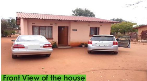
Front View of the house