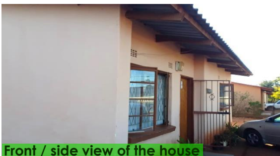
Front / side view of the house