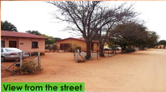
View from the street